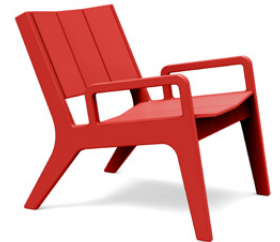
apple red: NO-NO9C-AR