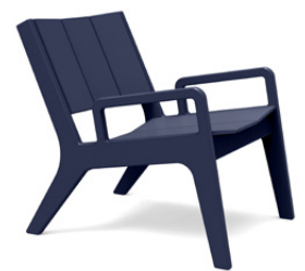
navy blue: NO-NO9C-NB